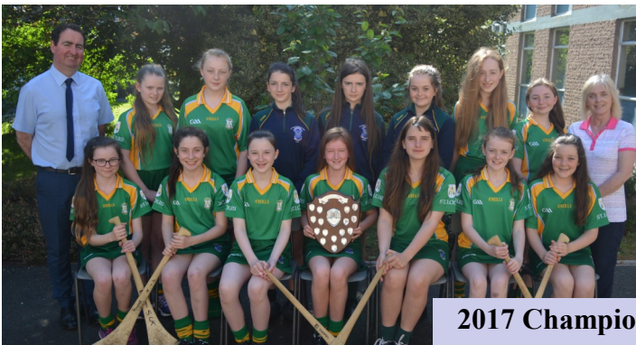
Down Schools Year 8 Camogie Shield Champions