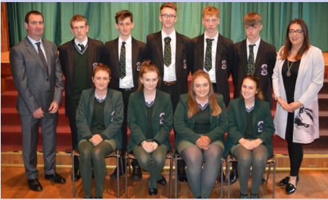
Excellent Achievement at GCSE