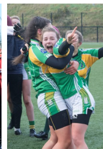
Ulster Schools Ladies U-20 Champions