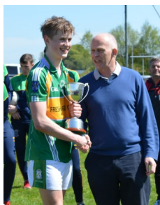
Ulster Schools U-15 Champions