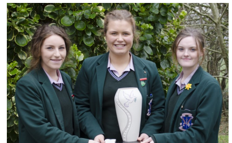
All-Ireland Schools Public Speaking Champions