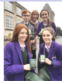
Gael Linn Success at Newry Feis