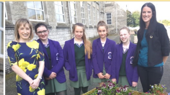
Celebration of European languages at St. Louis